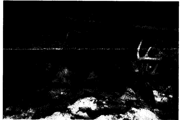
Officials are careful to prevent the taking of photographs such as this of the deer who are killed by bow hunting in Fairfax County.

Please fill out the survey before August 1 st and tell Fairfax County that the inhumane archery hunts are unnecessary and intolerable.